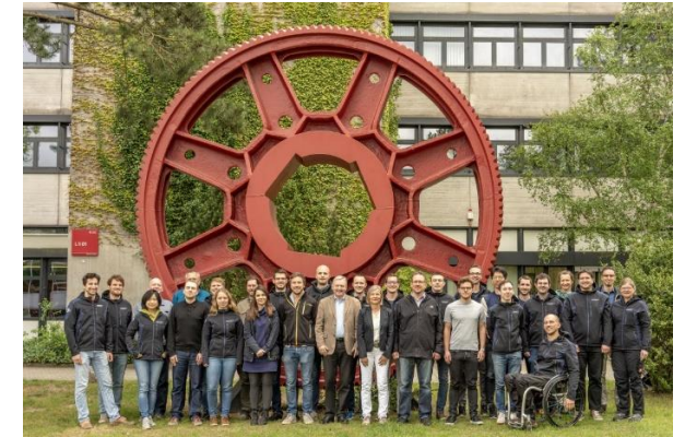
FZD faculty and staff 2019