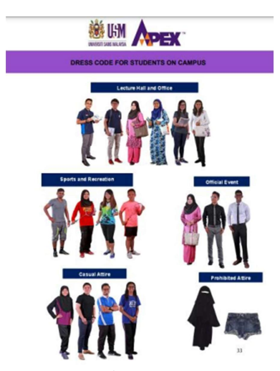
Dress code for students on campus