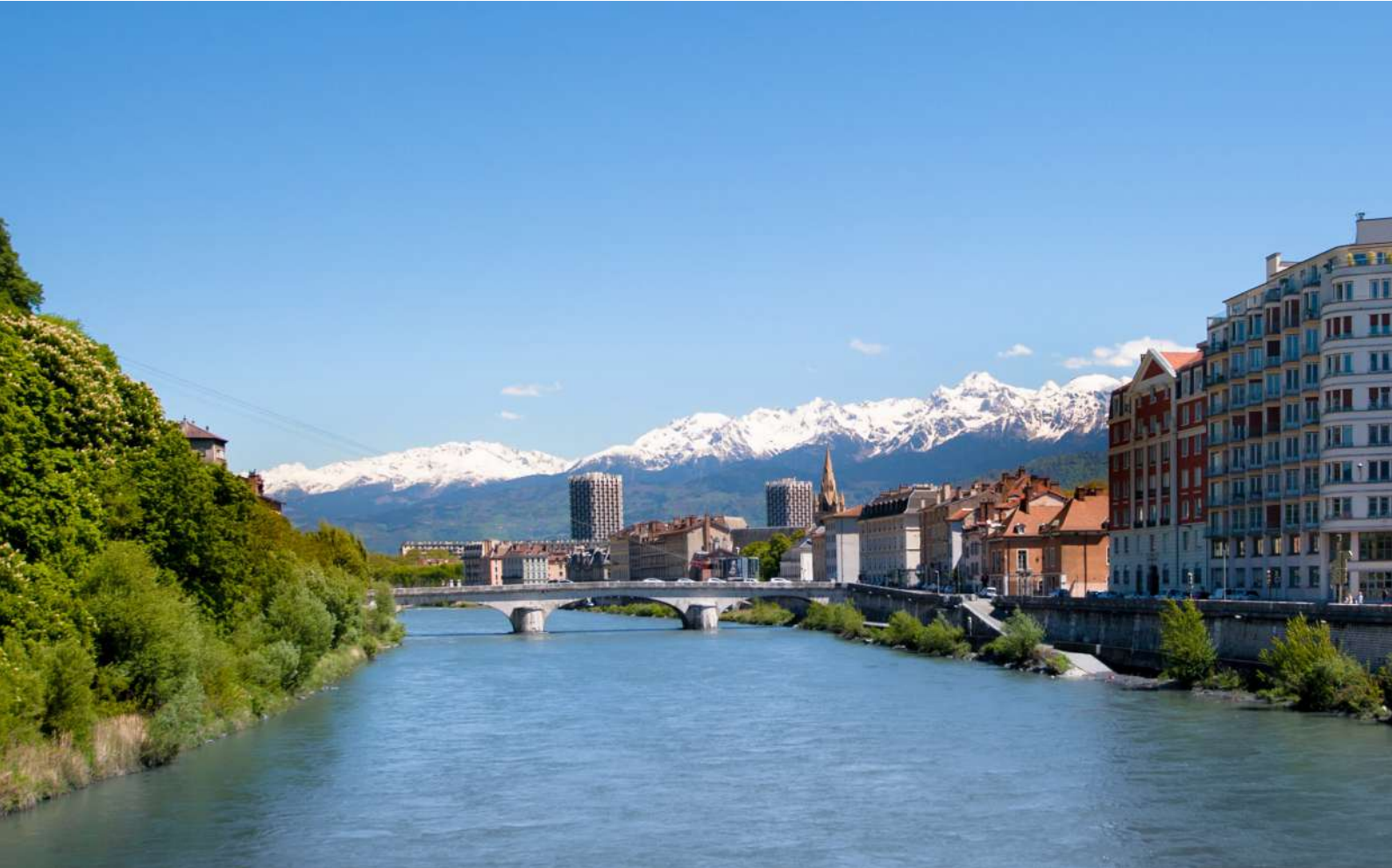
Grenoble city center