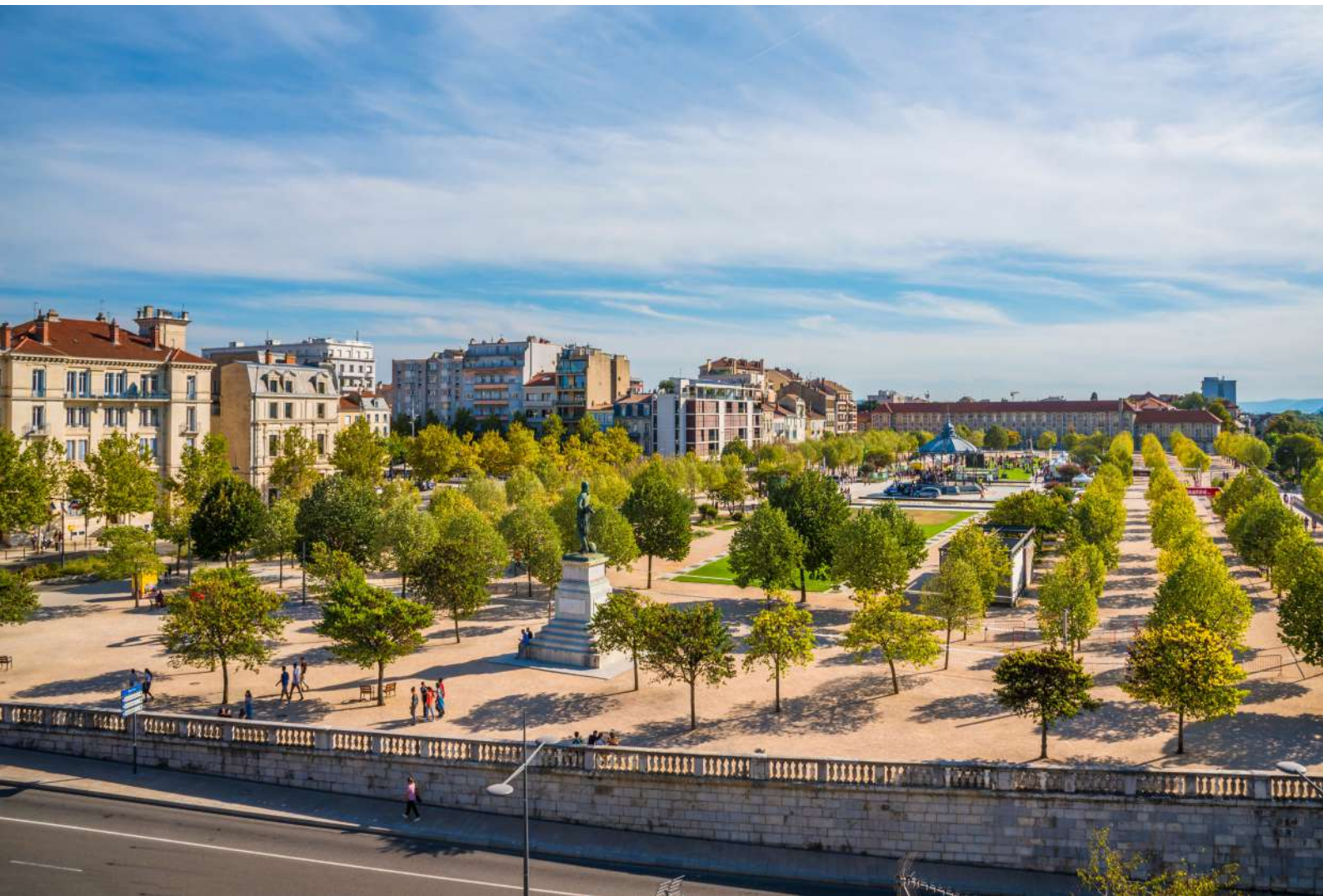
Valence city center